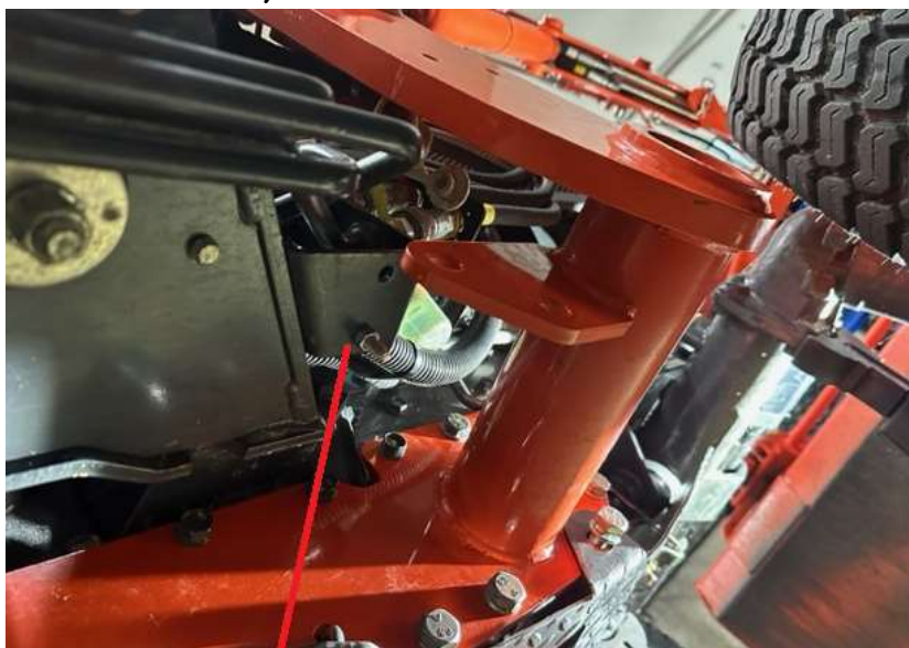
Add the supplied bolt and nut to existing hole